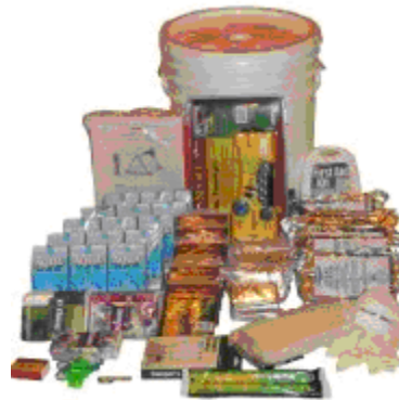
Figure 4. Office Survival Kit.