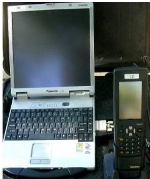
Figure 3. Pentagon Mustering System.

Pentagon Reservation Components are responsible for submitting Personnel Status Reports (Enclosure 8) to the PFPA Command Center (PCC) during emergency response actions. This report will be made via the quickest means possible and will provide data on missing occupants with emphasis on their last known status and location within the building. Contact the PCC in person (1A315), by phone (703-697-1001), fax (703-695-5435), or e-mail (Operations@PFPA.Mil). For all emergency response actions (shelter-in-place, relocation, and evacuation), personnel status reports shall be submitted to PFPA as soon as possible, with subsequent updates due every two hours until 100% accountability is achieved. In addition, PFPA may direct occupants to process through the Pentagon Mustering System (Figure 3) which is used to scan the building passes of evacuees for comparison with the building access control system to identify occupants who may still be in the building.